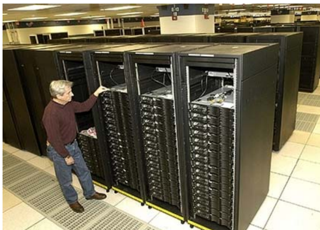
Kazakhstan plans to implement supercomputing technologies in the near future.

A supercomputer will have a capacity of 10-20 TFlops, meaning 10-20 trillion operations per second. An average modern computer is a thousand times slower. Kazakhstan will become the second CIS nation after Russia to establish its own system with a similar real performance. It