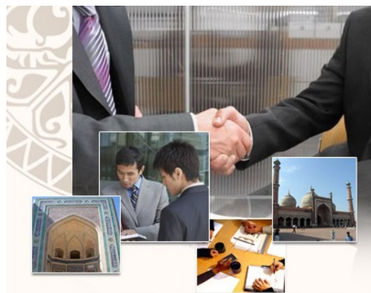
The sukuk will be issued as a result of cooperation between Kazakhstan and Islamic countries.

Islamic banking is based on the principles of Sharia. A distinctive feature of this type of financial activities is that it does not allow charging any interest on loans. To obtain income a credit institution must be an equal participant of a project, fully sharing risks, or engage in trade and to profit from the margin between the cost of acquiring goods and the sale price. According to Sharia, commercial operations involving trade of alcohol and cigarettes are prohibited.