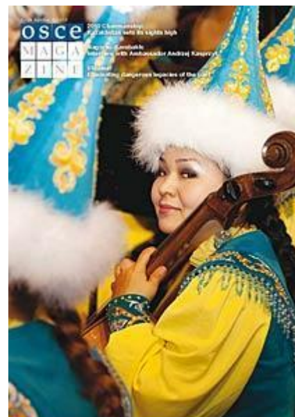
OSCE Press Office in Vienna dedicates OSCE Magazine’s first issue in 2010 to Kazakhstan’s Chairmanship

2010 also marks the 20th anniversary of the Charter of Paris for a New Europe and of the Copenhagen Document — groundbreaking texts marking the end of the Cold War and outlining the human rights commitments agreed by the States — and the 35th anniversary of the Helsinki Final Act, the OSCE’s founding document. Combine all this with the fact that the OSCE participating States are engaged in a challenging, high-level dialogue to address the future of European security, and it’s clear that 2010 will not be business as usual at the OSCE.