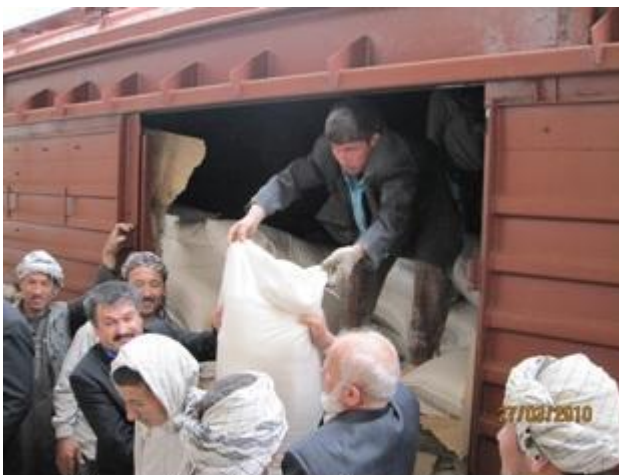
Kazakhstan has delivered 6,000 tons of rice as humanitarian assistance to the Afghan city of Hayraton

Kazakhstan has sent more humanitarian assistance to Afghanistan as the country continues to put its money where its mouth is when it comes to helping its regional neighbour.