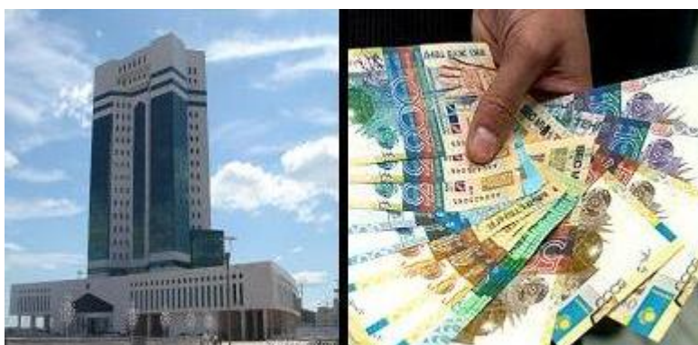
The Customs Union brings about salary increase for state employees in Kazakhstan

Since April 1, all budget organizations in Kazakhstan have seen a substantial increase in financing, which means public service employees, in turn, are having their salaries raised by 25%.