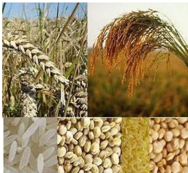
Kazakhstan’s grain acreage will cover 16.7 million hectares in 2010

Kazakhstan’s grain export has grown to 5.5 million tons in March 2010, Minister of Agriculture Akylbek Kurishbayev said this week during a government meeting in Astana. In addition, this year the Kazakh producers are looking for an increase in grain acreage, whereas the government is changing its model of subsidizing the agrarian sector.