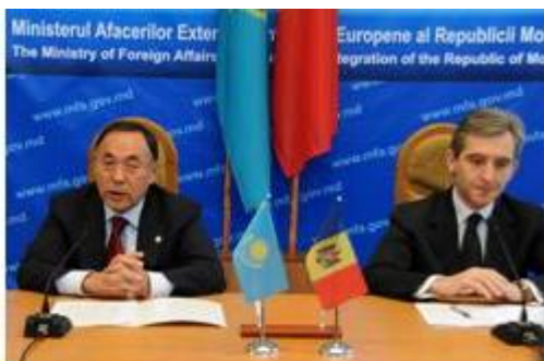
Kazakh and Moldovan Foreign Ministries have signed a memorandum of cooperation

“Kazakhstan’s 2010 OSCE Chairmanship is committed to building on the efforts of previous Chairmanships to address protracted conflicts in the OSCE area. We have seen positive developments in the Transdniestrian settlement process in recent months, including the consistent promotion of direct contacts and the resumption of the Expert Working Groups on Confidence-Building Measures,” Saudabayev said.