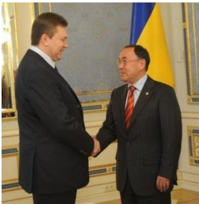
Kanat Saudabayev met the new leadership of Ukraine, including President Viktor Yanukovich, hailing the cooperation with OSCE and the recent presidential election

In Ukraine on March 31, Kanat Saudabayev met with President Viktor Yanukovich, Prime Minister Mykola Azarov, the Speaker of the Verkhovna Rada Volodymyr Lytvyn, Foreign Minister Kostyantyn Hryshenko and representatives of political parties. They discussed key aspects of the dialogue on European security between participating States of the Organization, and how the OSCE could support the domestic priorities of the new Ukrainian leadership.