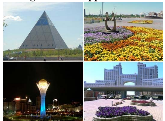
Astana has turned into a growing magnet for tourists, both domestic and international

“The most important thing is that Astana is becoming more comfortable for its residents and guests. The city provides a decent level of education. We are creating medical centers. We have unique objects, including the Independence Palace, the Kazakh Eli (The Kazakh Nation) monument, indoor stadium Astana Arena with 30,000 seats,”