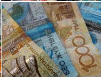
The government of Kazakhstan creates favourable conditions for both business development and the prosperity of the country.