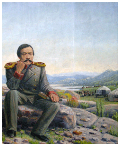
Chokan Valikhanov was a gifted man, who left an invaluable legacy in many facets of human endeavours, history, ethnography, folklore, art, geography, and education. Portrait of Chokan Valikhanov by Abylkhan Kasteev, oil on canvas, 1951.

Americans, and many others, will now have a chance to read in English of the great scientific and cultural legacy left behind by one of the most famous Kazakh researchers and thinkers, Chokan Valikhanov.