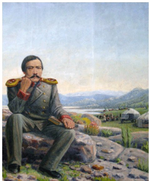
Chokan Valikhanov was a gifted man, who left an invaluable legacy in many facets of human endeavours, history, ethnography, folklore, art, geography, and education. Portrait of Chokan Valikhanov by Abylkhan Kasteev, oil on canvas, 1951.

Americans, and many others, will now have a chance to read in English of the great scientific and cultural legacy left behind by one of the most famous Kazakh researchers and thinkers, Chokan Valikhanov.