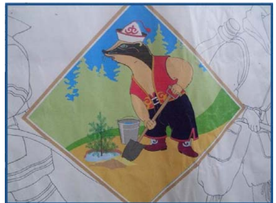
The image of a merry badger in a national costume proposed by Dinara Shukeyeva.