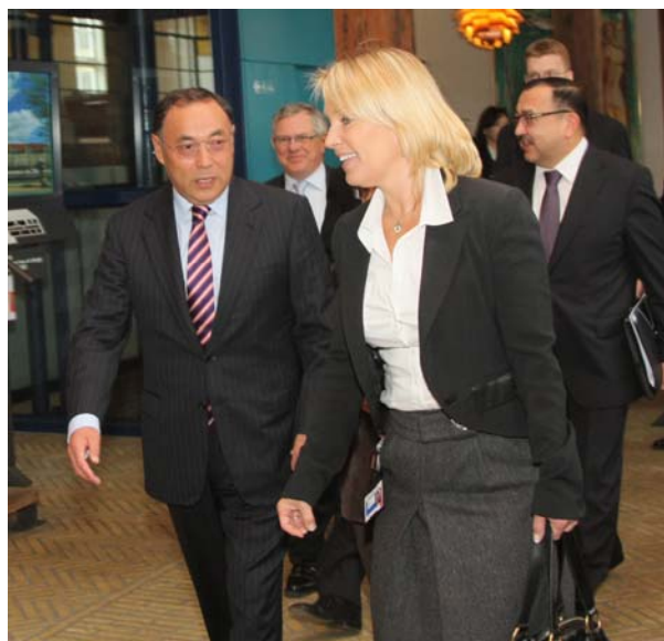
During the meeting Kanat Saudabayev of Kazakhstan and Lene Espersen of Denmark noted their common positions on a number of international issues.

Following the talks, the two Foreign Ministries exchanged Diplomatic Notes introducing a visa free regime for holders of diplomatic passports between Denmark and Kazakhstan. The cancellation of visa requirements for diplomats will promote more intense cooperation between the two countries in political, economic, scientific and cultural spheres, they said.