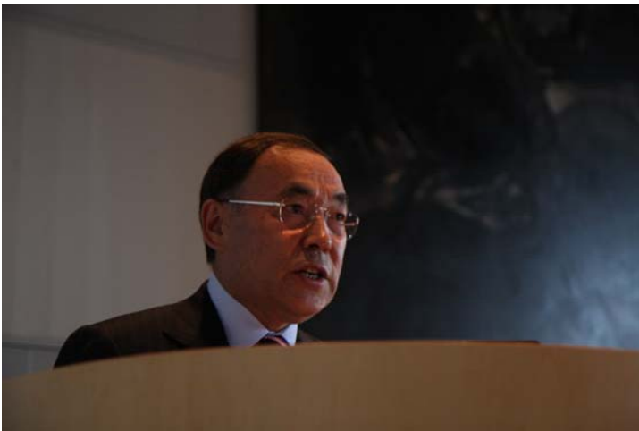
OSCE Chairperson-in-Office, Kazakhstan's Secretary of State – Foreign Minister Kanat Saudabayev addresses a conference in the Danish capital to mark the 20th anniversary of the Copenhagen Document, 10 June 2010.

Opening the conference, Lene Espersen stated: "Much has changed since 1990 when the Copenhagen Document was adopted. At that time, Kazakhstan did not take part in the CSCE process as an independent state. Today, Kazakhstan is chairing the OSCE. This provides us with an excellent illustration of how far we have come. In part, I believe, it is thanks to the commitments agreed upon in Copenhagen that we have managed to come this far and have made this incredible journey over a 20-year period".