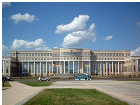
Celebrating the Day of Kazakhstan's Diplomatic Service (July 2) is a way to recognize the work of several hundreds of Kazakh diplomats in the central office of the Foreign Ministry and in posts throughout the world.