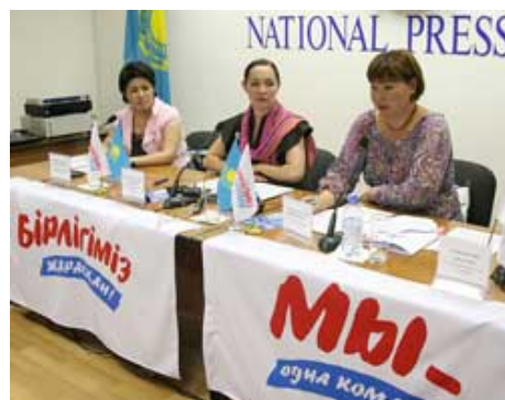
Activists of Civil Alliance of Kazakhstan from Astana, Atyrau and Temirtau, who initiated the movement, gathered at the National Press Club in the capital on June 30 to sum up the preliminary results of the nationwide "We are one team" campaign of NGOs helping disadvantaged groups of citizens.

Summing up the results of all steps taken within such a short period, the Civil Alliance organized a forum titled "Birligimiz zharaskan!" (Kazakh for We are one team!) and involving nearly 5,000 people from across the country. This dialogue platform was aimed at getting through to the population the major mission of the Civil Alliance's activity, and to reward the heroes of the activities.