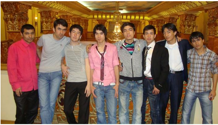
Afghan students pose for a group photo at the Abai Kazakh State Opera and Ballet Theatre in Almaty