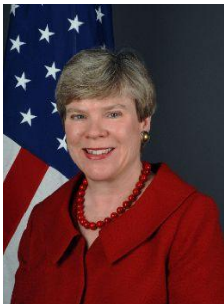
Rose Gottemoeller

The 20 th anniversary of the closure of the Semipalatinsk nuclear test site in Kazakhstan reminds “that the way to finally preclude nuclear weapon test explosions or any other nuclear explosions is through universal signature and ratification of the Comprehensive Nuclear Test Ban Treaty and its entry into force”, Rose Gottemoeller, U.S. assistant secretary of state for arms control, verification and compliance said.