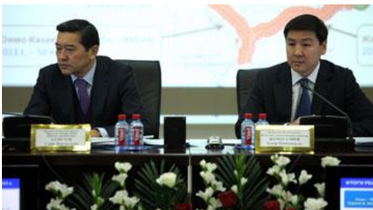
First Deputy Prime Serik Akhmetov (L) chairs the session of the board of the Ministry of Transport and Communications as Ministry's newly appointed head Askar Zhumagaliyev delivers a report.

"Currently, we have 126 lines operating in 53 service centres. Out of 3.4 million, 2.8 million vehicles will undergo technical inspection this year. Therefore, we plan to arrange 400 lines in 200 centers in order to ensure 100 per cent coverage of all vehicles subject to technical inspection," the minister said.